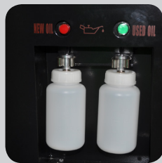
Oil injection & drain controlled by switch

Recovery. Vacuum. Recharge. Oil Injection.