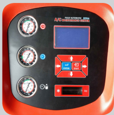
Friendly interface Run by hot key